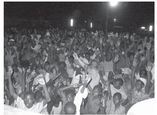
Thousands gathered to hear the Gospel preached in power

On Friday night of the crusade, with more than 3,000 in attendance, the power of God was demonstrated and approximately 1,000 people, predominantly Muslim, gave their lives to Jesus. One particularly dramatic healing occurred in a lady who had been diagnosed with breast cancer. She rushed to the stage to testify that her cancerous tumor had fallen to the ground during the corporate prayer. She also reported that she was able to see light out of her previously blind eye. After hearing her testimony, 500 came forward to receive Jesus and more healings continued!