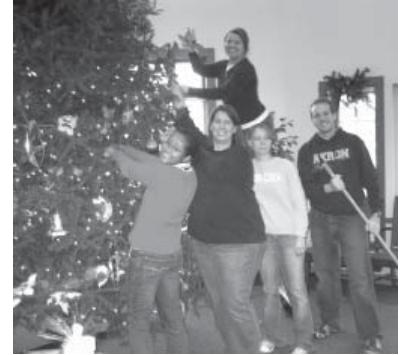
We had a blast sharing Jesus' love by decorating nursing homes for Christmas! We also coordinated projects at the Jackson Township Safety Building, Library, Park, and Jackson schools.

Testimony: Recently, one gentleman in his 40's shared that he had arthritis-type pain in his hands since the age of nine. As we prayed for him, he was able to open and close his hands, testifying that the pain was completely gone!