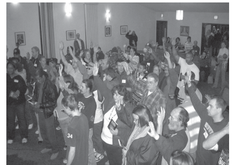
GOC participants respond to the true message of Christmas - Jesus!

Testimony: Recently, one gentleman in his 40's shared that he had arthritis-type pain in his hands since the age of nine. As we prayed for him, he was able to open and close his hands, testifying that the pain was completely gone!