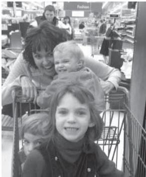
Christmas shopping with GOC participants is fun!

Frontline works in conjunction with area agencies during the Christmas season to help meet the needs of low income and homeless people in our community. Our 5th annual community outreach will be held on December 5. Participants include hundreds of residents from places such as Massillon Family Living Center, Canton YWCA, New Life Center, and Refuge of Hope Homeless Shelter in Canton. Donations of time and resources are appreciated. Please call our office for more information on how you can help.