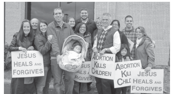
Standing for life at a local "life chain"