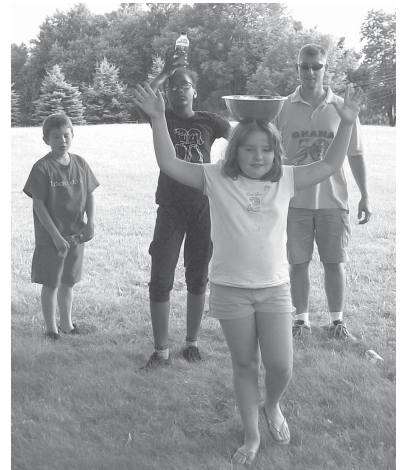
Our Kingdom Kids had fun learning about other cultures, including how to carry objects on one's head as done in Ghana, West Africa.

Frontline participated in the "40 Days for Life Campaign" in Canton this fall as part of a nationwide effort to end abortion. This movement included fasting and prayer, along with daily peaceful demonstrations of the Lord's heart for the unborn. Since October, over 300 babies nationwide have been reported to have been saved from death as a result of this collaborative effort.