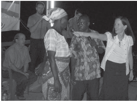
This woman was healed of breast cancer!

The miracles in the north continued throughout the rest of the trip. Two churches were planted in nearby villages, local pastors partners with us for a two-day regional crusade, and our Kingdom Bible School for indigenous pastors and leaders was held.